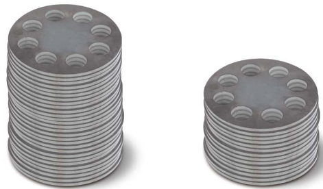
With Rapid Part

When purchasing a new cutting table be sure to ask about cut-to-cut cycle time. Some cutting table manufacturers are able to deliver similar results using their own CNC, THC, and nesting software products combined with Hypertherm plasma systems.