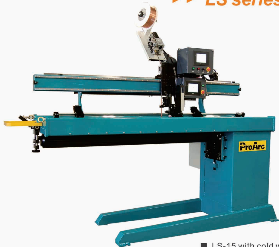
■ LS-15 with cold wire feeder

ProArc seamers are designed for straight line welding of all weldable metals of thickness from 0.1mm to 10mm. It provides 100% penetration, single pass weld on untacked cylinders and flat sheets without heat distortion to the material. This optimizes any process which reduces welding costs and improves the quality of the weld.