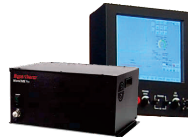
Micro EDGE Pro CNC controller

ProArc Magicut is a cost-effective cutting solution in its class. By integrating plasma and oxyfuel torches which can support general cutting application. It's compact design provide maximum working area with smallest floor space requirement.