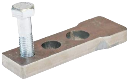
With True Hole technology

True Hole®, part of Hypertherm's SureCut™ technology was launched in 2008 with the HPRXD® autogas family of products. It is now also offered on Hypertherm's new XPR300™ system. TrueHole for mild steel produces significantly better hole quality than what has been previously possible using plasma. Equally important, True Hole technology is delivered automatically without operator intervention, to produce unmatched hole quality.